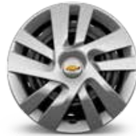
Aluminum-Clad Wheel Covers (Available with Appearance Package)