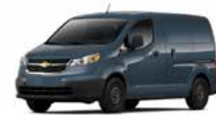
Blue Ink (32U)