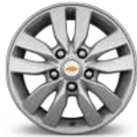
15" Aluminum Wheel (Available on LT)