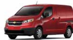
Furnace Red (J0U)