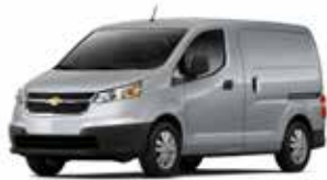
Galvanized Silver (K0U)

THESE SHOULD ALL BE LT'S WITH APPEARANCE PACKAGE JELLYBEANS