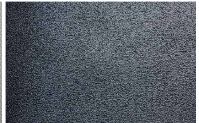
Vinyl Cargo Floor Covering—Black