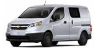
Driver-Side, Passenger-Side and Rear-Door Glass