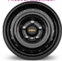
15" Steel Wheel (Standard on LS and LT)