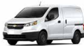
Designer White (GQX)