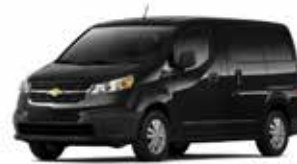
Black Pipe (2QU)