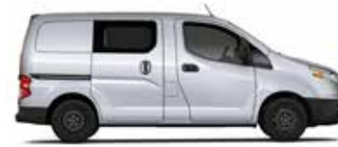
Passenger-Side and Rear-Door Glass